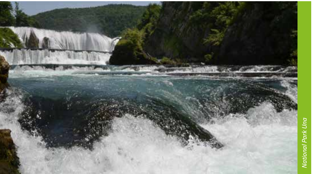
National Park Una

Una is almost with its entire longitudinal cascading river. It is special for its sedentary barriers, which are also the biggest value of the river Una. Sedentary barriers create waterfalls, riverside islands, cascades, beech trees and larger waterfalls associated with tectonic movements. The sediment sedimentation process, in pure natural waters is the result of certain physic-chemical and biological processes of calcite precipitation in karst waters, as a circuit process in strictly certain conditions of biotope, pH, and temperature, saturation of calcium carbonate, calcium and magnesium content.