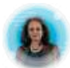
H. E. Ms Sahle-Work Zewde Chair, International Commission