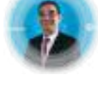
Justin Yifu Lin